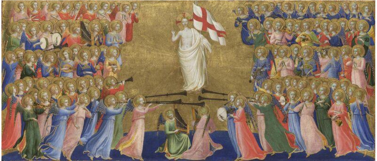
CHRIST GLORIFIED IN THE COURT OF HEAVEN - FRA ANGELICO