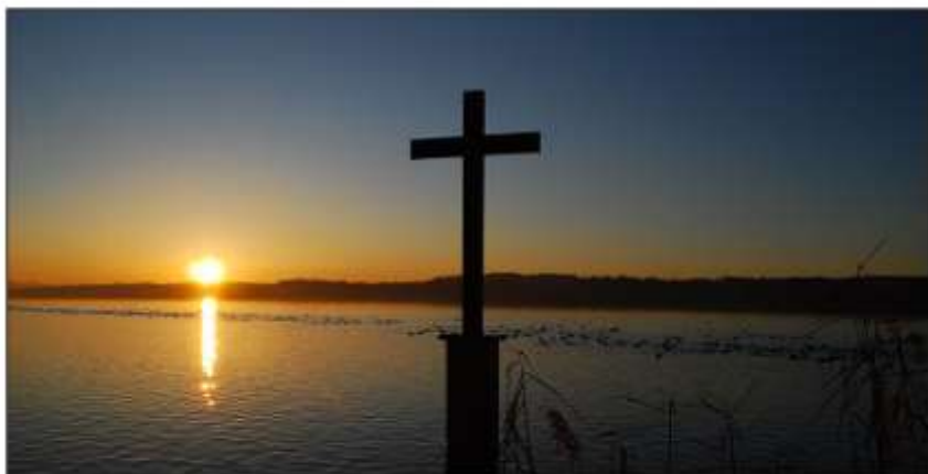
Lake Starnberg, Germany, 2009

The word “Lent” means “lengthen,” and it’s about the days getting longer. The early Church began to practice a season of preparation for those who would be baptized at Easter, and before too long, other members of the Christian community joined those candidates for baptism as an act of solidarity.