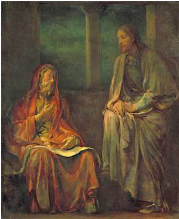
VISIT OF NICODEMUS TO CHRIST (1880) JOHN LAFARGE