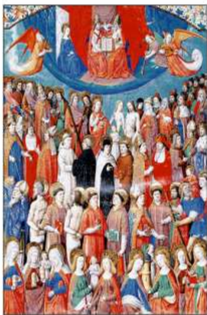
"Paradies," from the manuscript "Die Couture des Rois" by St. Augustine of Hippo (104-105), Bibliothèque Sainte Geneviève, Paris, France

O God, the Maker and Redeemer of all believers: Grant to the faithful departed the unsearchable benefits of the passion of your Son; that on the day of his appearing they may be manifested as your children; through Jesus Christ our Lord, who lives and reigns with you and the Holy Spirit, One God, now and for ever. Amen ("Holy Women, Holy Men," p. 665).