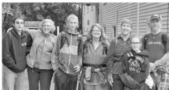
The pilgrims gathering together before they begin on Fri, Oct. 24.

The pilgrims traveled from Christ Church, Babylon to Cathedral of the Incarnation over the course of three days and concluded with a Pilgrim's Mass.