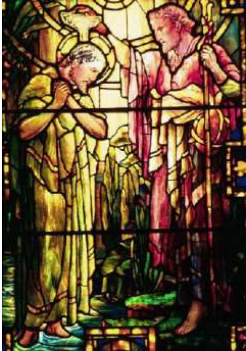
THE BAPTISM OF CHRIST, LOUIS COMFORT TIFFANY