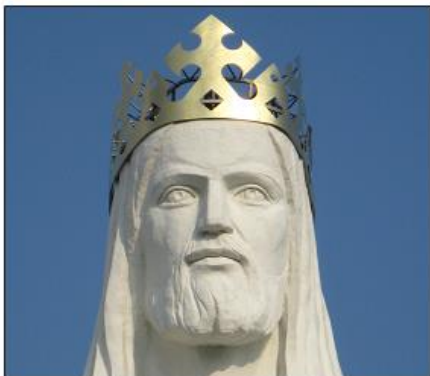
(Statue of Christ the King in Świebodzin, Poland)

Almighty and gracious Father, we give you thanks for the fruits of the earth in their season and for the labors of those who harvest them. Make us, we pray, faithful stewards of your great bounty, for the provision of our necessities and the relief of all who are in need, to the glory of thy Name; through Jesus Christ our Lord, who lives and reigns with you and the Holy Spirit, one God, now and for ever. Amen (Book of Common Prayer, p. 246).