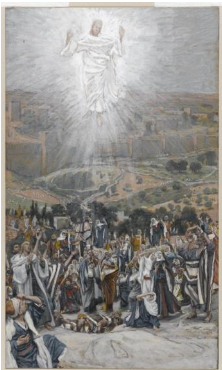
L'Ascension (James Tissot 1836-1902)