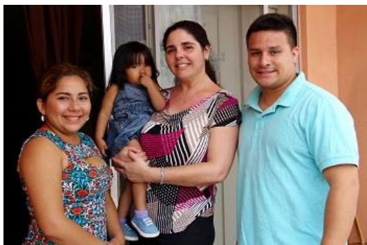
This family was welcomed by Episcopal Migration Ministries to Miami, in the Diocese of Southeast Florida

In 2000, the United Nations General Assembly established June 20 as World Refugee Day to recognize and celebrate the contribution of refugees throughout the world and to raise awareness about the growing refugee crisis.