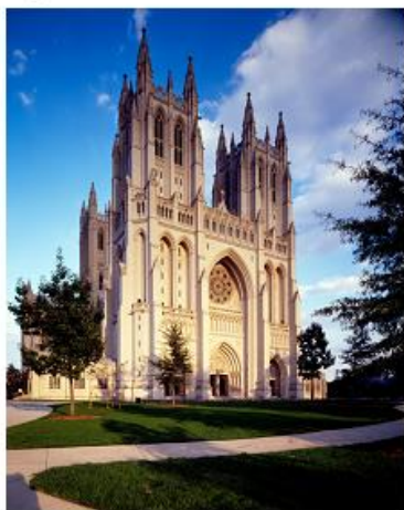
Washington National Cathedral

All are invited to join a Vigil Celebration and Eucharist, sponsored by the Union of Black Episcopalians (UBE) in honor of the 27th Presiding Bishop on Saturday, October 31 at 11 am Eastern at the Armory, 2001 E. Capital St. SE in Washington, DC. The Domestic and Foreign Missionary Society will sponsor a live webcast of the Vigil Celebration at www.episcopalchurch.org . More information on tickets for the event can be found here: http://tinyurl.com/UBEcelebration