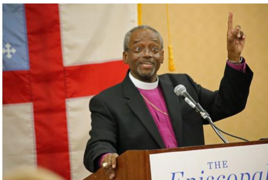
Presiding Bishop-Elect Michael Curry

Almighty and everlasting God, from whom cometh every good and perfect gift: Send down upon Presiding Bishop-Elect Michael Curry and upon the congregations committed to his charge, the healthful Spirit of thy grace: and, that he may truly please thee, pour upon him the continual dew of thy blessing. Grant this, O Lord, for the honor of our Advocate and Mediator, Jesus Christ. Amen.